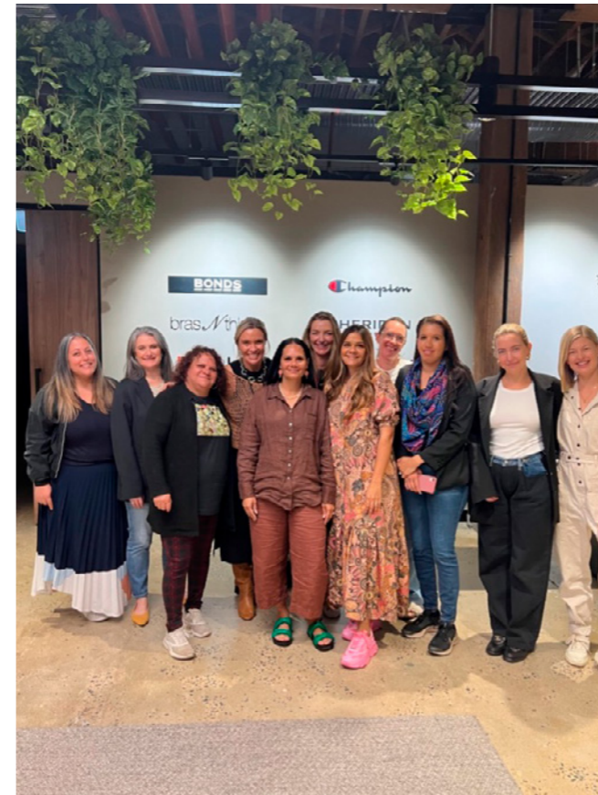
Team involved in FNFD Incubator Program