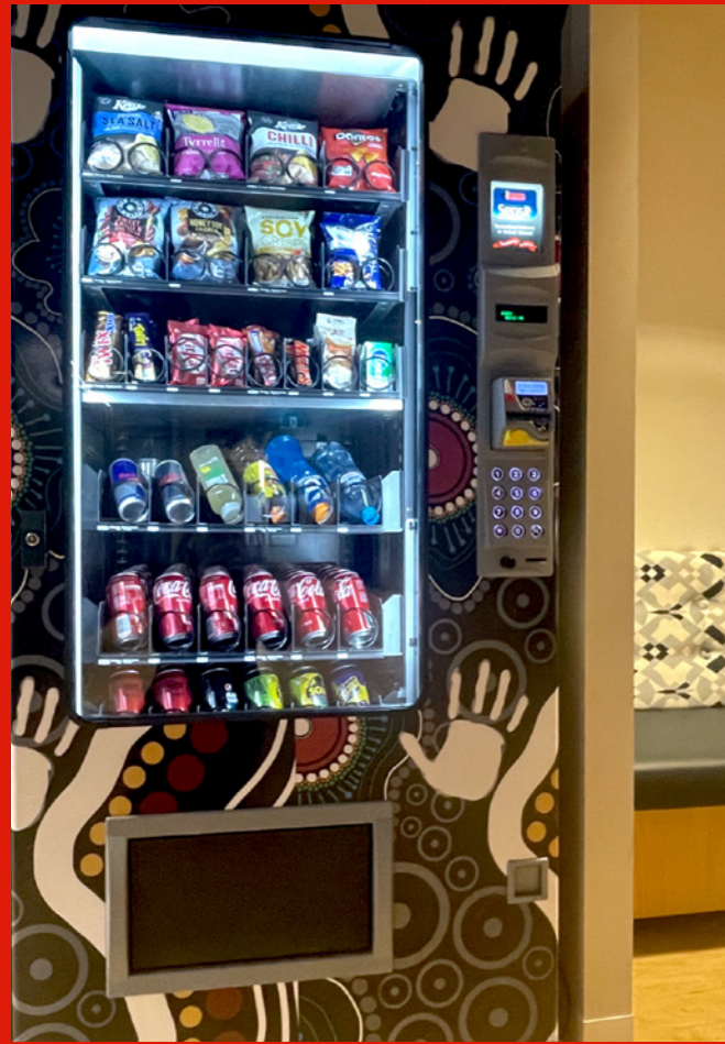
Vending machines from Blackroo Industries in Hanes' Pyrmont office

With no central sourcing and procurement team at Hanes Australasia, we want to equip all team members making purchasing decisions with resources to help direct them to First Nations suppliers where possible. Our focus has been on educating our broader business teams on where they can seek out Aboriginal and Torres Strait Islander businesses when making purchases for either business or personal use. This has been across all areas of the business from marketing teams sourcing talent and crew for shoots, as well as booking media with first nations providers, to Support teams covering all areas of the business from legal to IT, finance to property management and more. In particular we have assisted teams to learn about Supply Nation, the New South Wales Indigenous Chamber of Commerce and Kinaway, the Victorian Indigenous Chamber of Commerce. Information regarding these organisations was shared during a 500 person town hall event in our organisation.