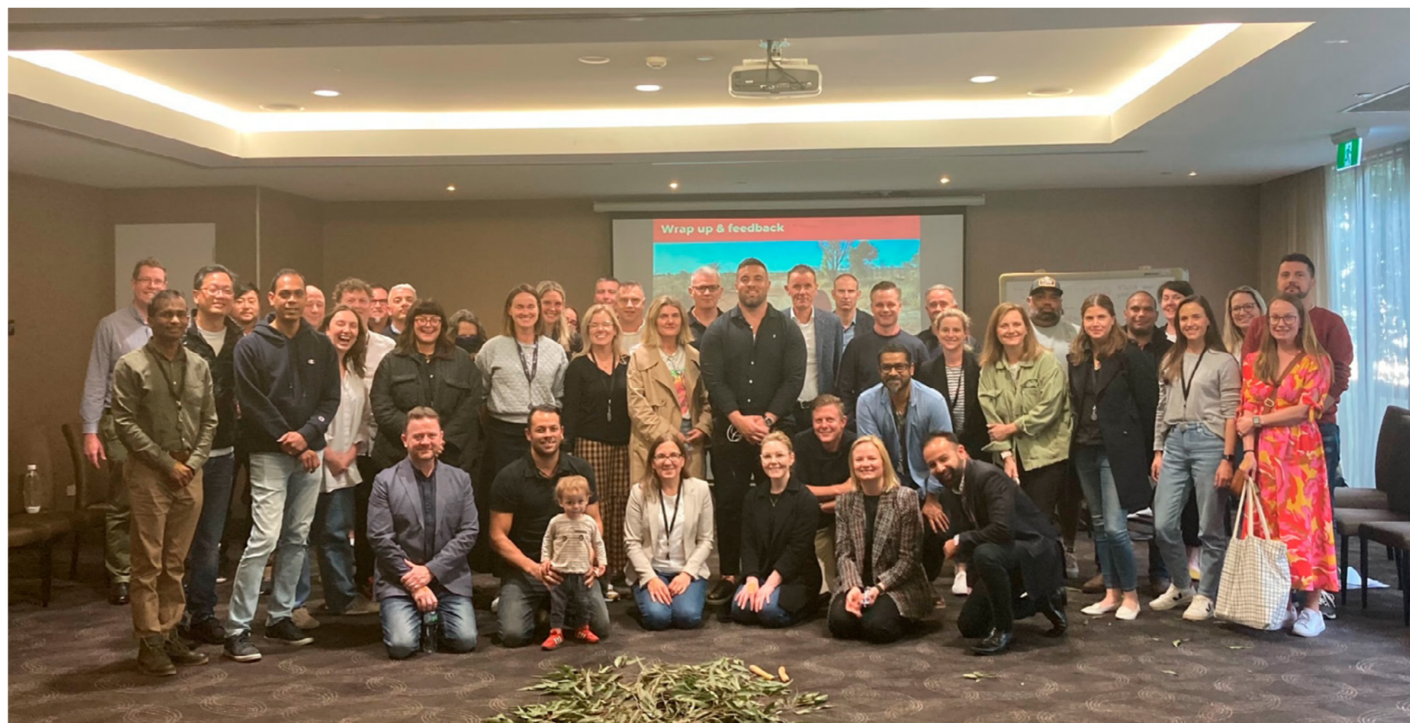
Red Dust cultural immersion session, Hanes Senior Leaders 2022

Hanes Australasia acknowledges Aboriginal and Torres Strait Islander peoples as the Traditional Custodians of Country and recognises their continuing connection to land, waters and culture. We pay our respects to Elders past, present and to emerging leaders.